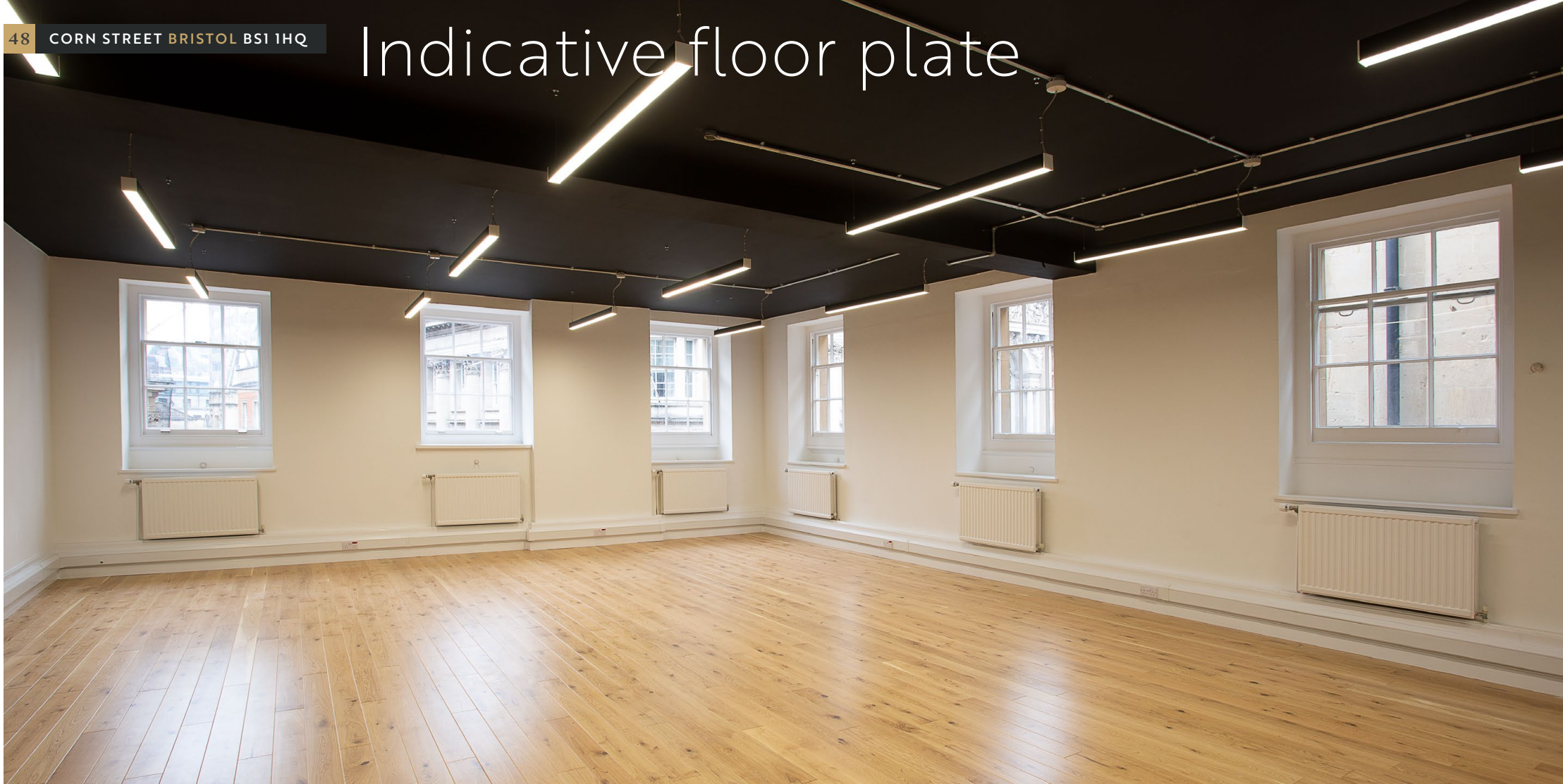
INDICATIVE FLOOR PLAN